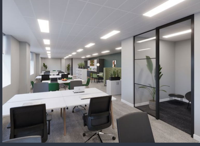
Open plan office and quiet room